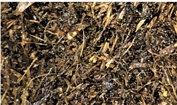
NUFIBER 3X AFTER ABSORPTION