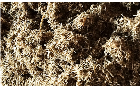
NUFIBER 3X BEFORE ABSORPTION